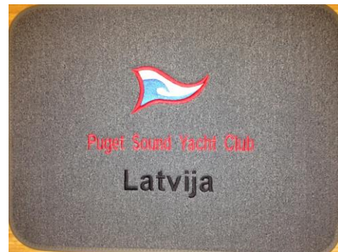
Sample Door Mat